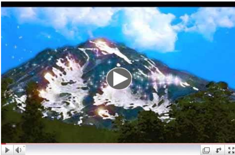
Integrating Your Third Eye With Your Personal and Planetary Chakras Part 2-Becoming Earth

http://www.youtube.com/user/suzannelie#p/u/0/5l9jWxurEuY