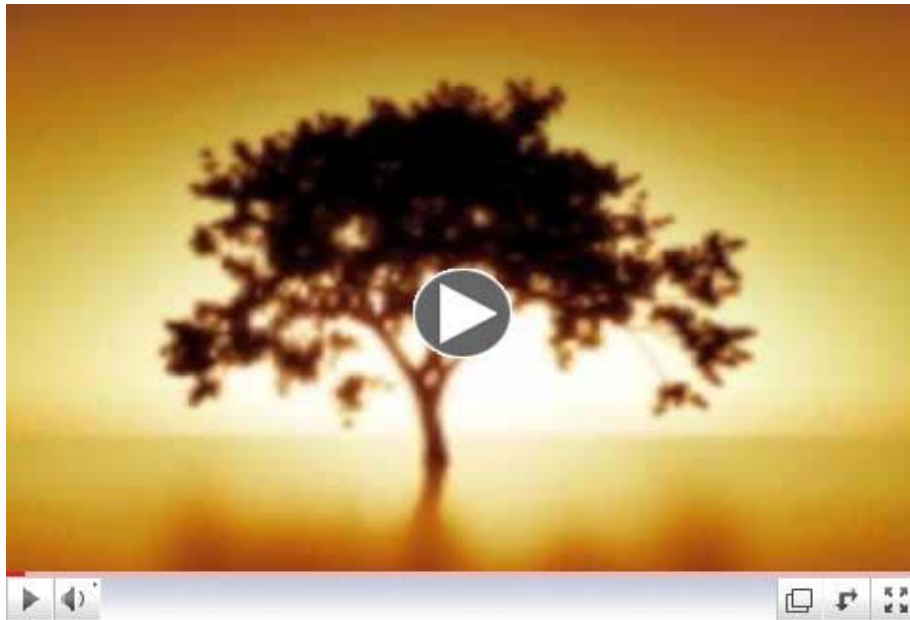
Integrating Your Third Eye Your Crown of the Elohim Part 1- Becoming Elohim