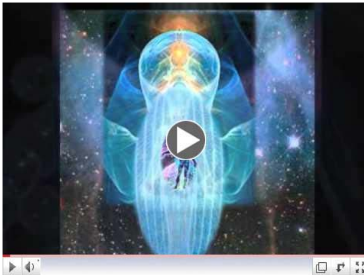
Our Multidimensional Operating System Part 2