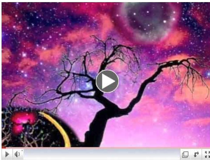
Creating New Earth Part 1