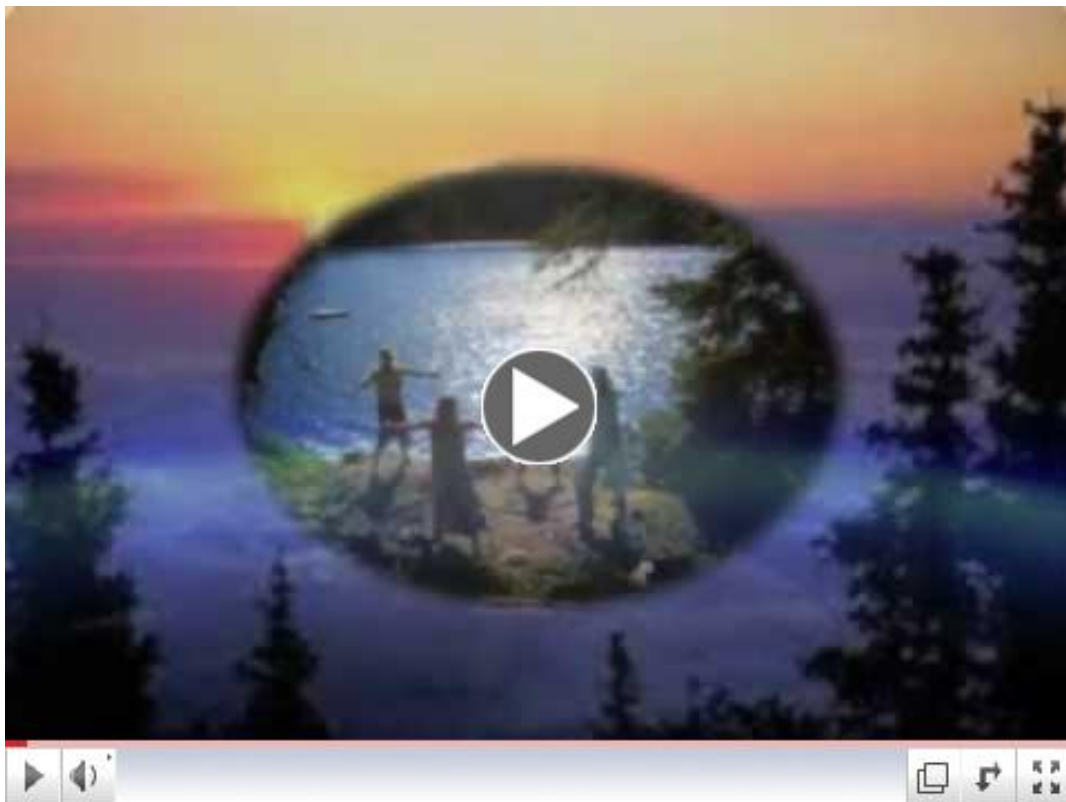
4 For Gaia

We, the members of humanity, were the ones who damaged our planet, and WE are the ones who will heal it. Therefore, I suggest that once we have expanded our unity consciousness into the fifth dimension that you use the Venusian Healing Technique that I received the night after the Venus transit. This healing technique can be used to heal any given area of Gaia's planet on an energetic level.