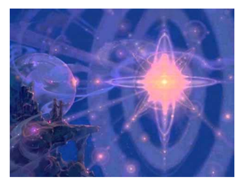
http://youtu.be/eN3mCA1q6yI Inner SELF You Tube