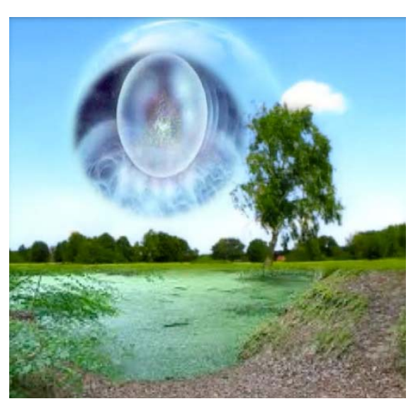
PARALLEL REALITY OF EARTH

Fortunately, when you expand you consciousness into the higher brain waves of Theta, Delta waves and beyond, you can have conscious interactions with your Higher SELVES who have taken a home in the higher worlds. We say home rather than body, because some of your highest realities of SELF are no longer limited to a form and live as pure consciousness. These higher expressions of your SELF live in Unity Consciousness and no longer desire to be an individual. This is the case for the Arcturians who are now speaking with you. We resonate to the eighth through tenth dimensions in a Unified Field of unconditional love and multidimensional light.